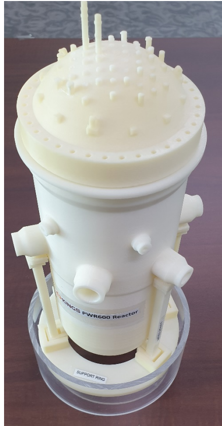
PWR600 Reactor Assembly with Support Column and Pad