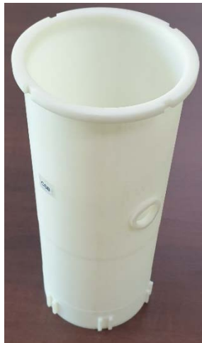
Core Support barrel