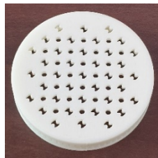
Guide Structure Support System