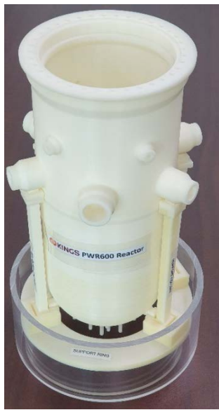
Reactor Vessel and Support Column