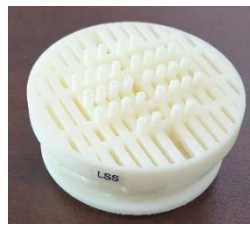
Lower Support Structure