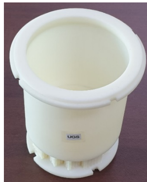
Upper Guide Structure